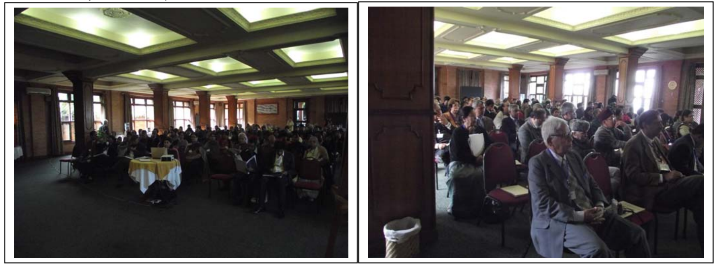
Participants at the Regional Consultation

More than 150 participants engaged in in-depth discussions on effective strategies for addressing human rights issues in the region and making state institutions responsive to citizens' activism in promoting human rights and democratic practices. The areas under discussion were transparency and accountability of South Asian parliaments, security laws and freedom from torture, discrimination against religious minorities and internally displaced persons in South Asia. Speakers from Afghanistan, Bangladesh, Bhutan, India, Maldives, Nepal, Pakistan and Sri Lanka also presented reports on the challenges for human rights and democracy in their respective countries.